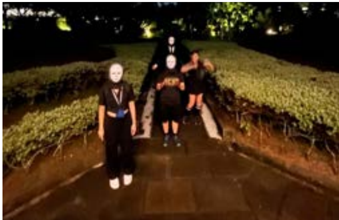
Left: Running MACO. Right: The poor ghosts on-duty for Trick-or-Treat.

C/O One Stop @ SAC, 50 Nanyang Avenue, NS3-01-03 Academic Complex North, S(639798)