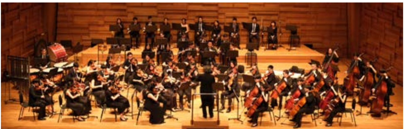
A picture from the orchestra's performance of Beethoven Symphony No. 5 at Masterworks II.

This was also our first time collaborating with an external organisation, New Opera Singapore, to perform operatic works at our concert.