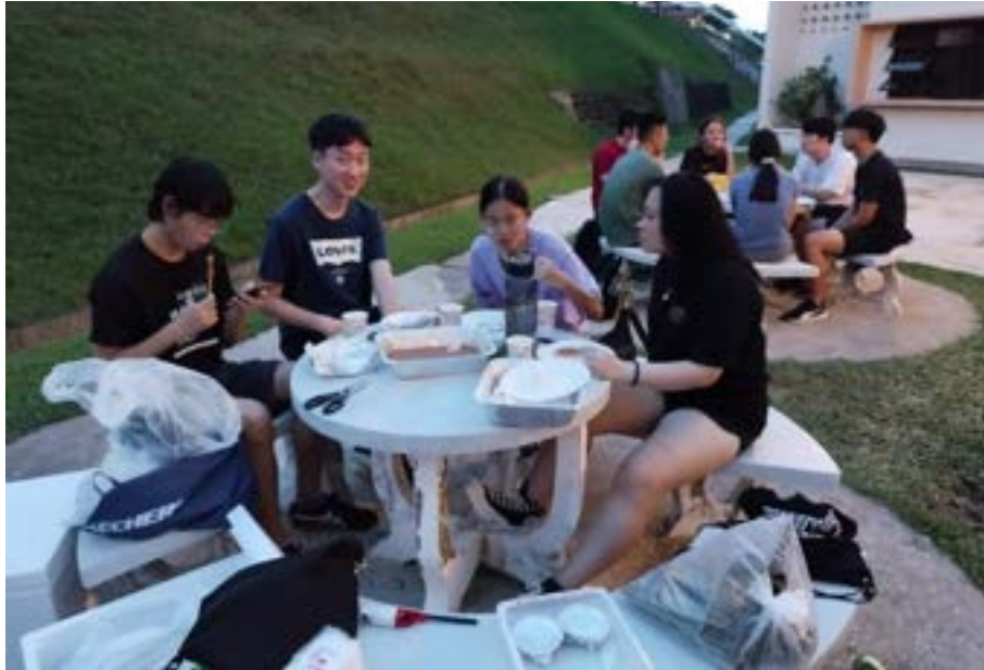
Our members during the barbecue

and led by our Welfare Head, allowing us to identify potential Exco members through their interactions and planning of this event.