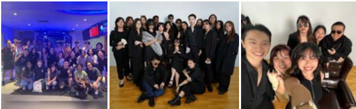
Photos of the 33rd Directing Committee, Management Committee and Top 6

As the President of the Cultural Activities Club (CAC) for the Academic Year 2023/2024 (AY 2023/24), I had the privilege of leading a dedicated team in promoting performing arts and culture within our community.