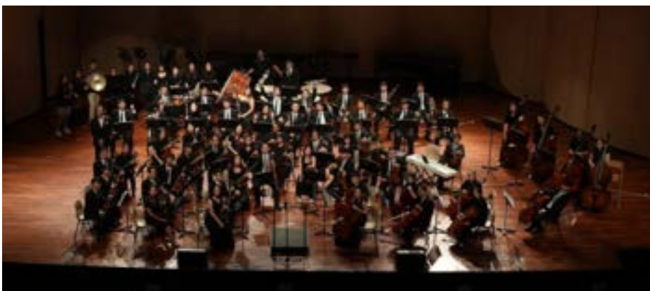
A picture of the full orchestra taken on stage after Musica per Tutti.

Since AY 23/24 was the first time complete beginners were accepted into our Percussion section, the Percussion Ensemble's performance at Musica per Tutti was of notable importance, proving that it was possible to perform ensemble pieces despite having only less than 5 months to practise a completely new instrument.