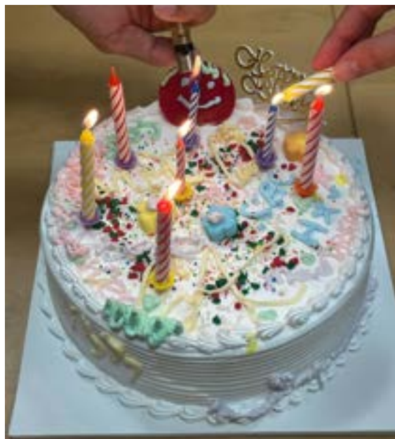
A cake representing the pinnacle of MACO's creativity!

Lastly, the rest of Top 6 and I also made an effort to ensure we did not miss a birthday during the term, and celebrated birthdays jointly after meetings. In total, MACO had 5 joint-birthday celebrations throughout the entire term, and we hope you all liked eating cake. I will remember the ugliest one fondly.