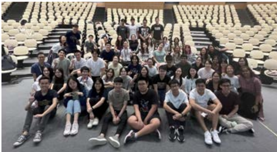
Welcome Night AY23/24

During the event, new members were introduced to the choir’s practice schedule and familiarised with the overall structure of our rehearsals. They were also briefed on the upcoming goals and initiatives for the academic year, including plans for performances, competitions, and other key activities. Additionally, information about committee recruitment was shared, offering new members opportunities to take on leadership roles and contribute more actively to the choir’s development.