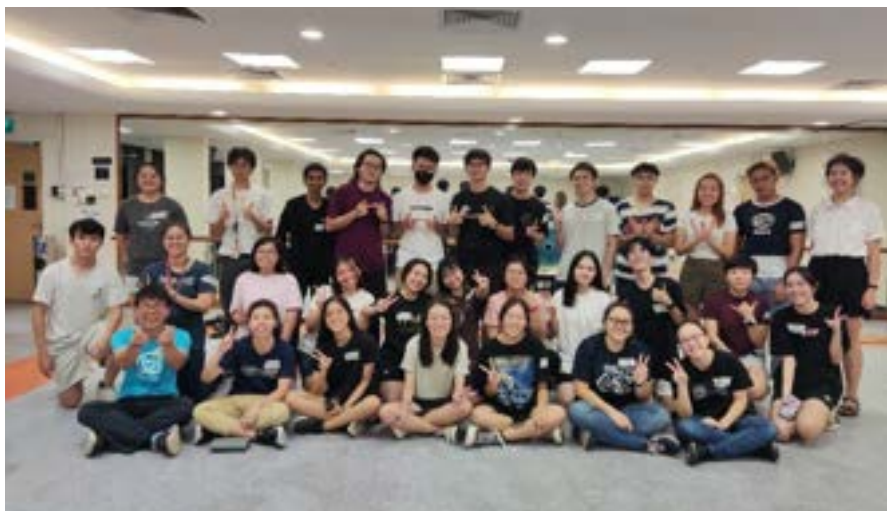
Group photo of members post-training session

We also managed to get all Exco members involved during training sessions, allowing our members to have seniors to clarify their doubts while our instructor was teaching. Previously, not all Exco members were required to be present during training sessions and we felt that this limited the interactions between them and our members. Therefore, we put in conscious effort to ensure increased interactions to build a more close-knit community.